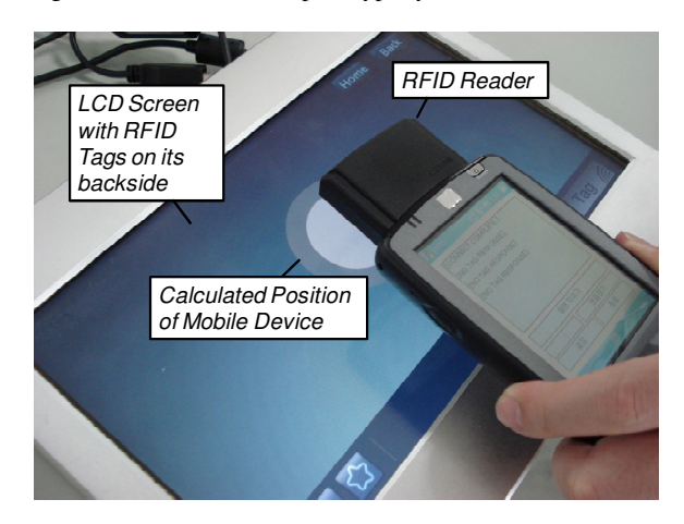
Figure 2. Prototype system in use

A prototype system is implemented to show the practical viability of our method. A tablet PC with 12-inch LCD screen is used as the interactive screen. 16 RFID tags, arranged in a 4x4 grid, are attached on the back side of the screen. A PDA with a CF-type RFID reader serves as the mobile device and communicates with the tablet PC via Wifi. Figure 2 demonstrates our prototype system in use.